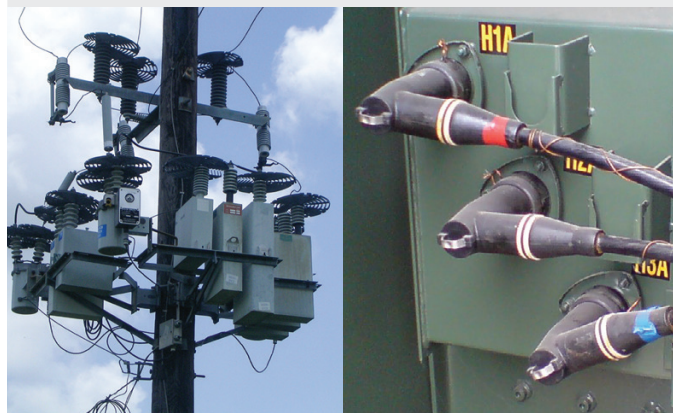
Typical distribution transformers where maintenance and monitoring are critical

Repairing or replacing a transformer is expensive. A thermal camera pays for itself when you consider the money saved by having the ability to fix a problem before it results in a shutdown. Through regular thermal inspections, you can rapidly detect and locate overheating areas on the surface of a transformer or hot spots on electrical connections. Once you determine that something is overheating you can investigate further, such as with ultrasonic, vibration, or oil analysis. The benefits of catching hot spots early include extending the life of otherwise well-functioning equipment; prevention of equipment failures that could lead to widespread outages, reduction of costs through maintenance as opposed to replacement of damaged equipment, and improved safety by reducing the risk of fires or explosions that may result from transformer failures.