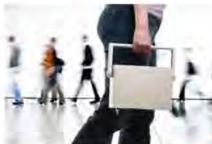
YES Plus LGA (picture above) is housed in a rugged ABS enclosure with swivel handle to act as a stand support or for carrying the instrument.