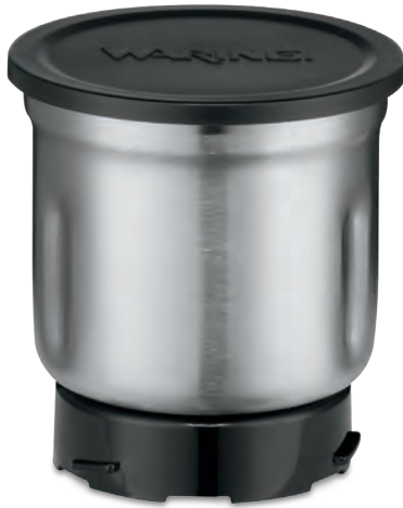
CAC103 Stainless Steel Bowl with Lid