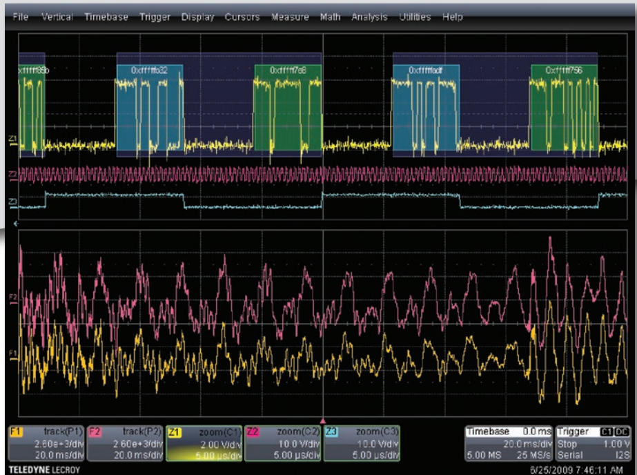
Teledyne LeCroy's unique View Audio feature converts digital audio data into analog waveforms for easy digital audio analysis and debug.

Teledyne LeCroy's serial Audiobus trigger, decode, and graph package provides all the tools needed to properly analyze and debug digital audio buses. Teledyne LeCroy's solution addresses the I 2 S, LJ, RJ, and TDM variations of the audio bus standard.