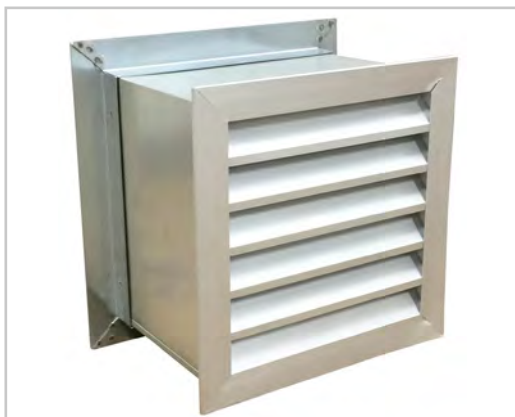
VS-12 Louvers and Sliding Collar