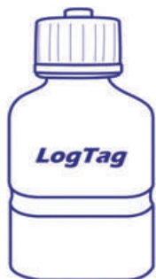
Buffer Assembly Not Included (Silica sand recommended for temperatures below -40°C)