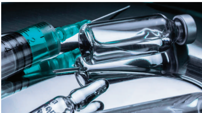
Vaccine & Pharmaceuticals