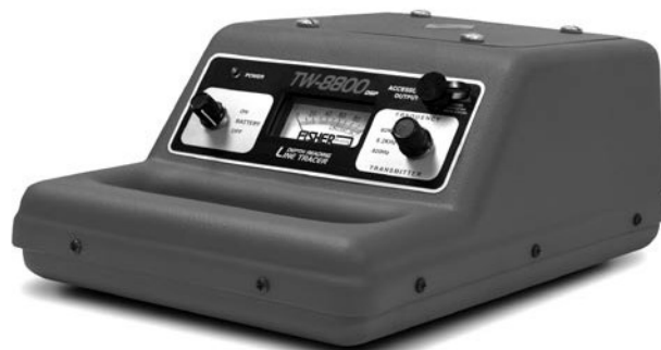
The TW-8800 Transmitter.

WARNING: Do not connect output leads to a live (energized) utility. Please prevent shock hazard and equipment damage.