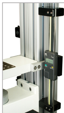
Optional digital travel display

The TSFM500-DC is shown in a typical spring testing application, with Model M5-1000 digital force gauge and compression plate.