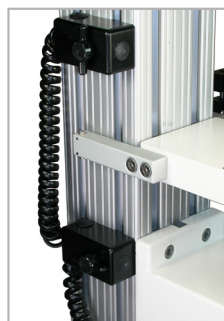
^ Included set of adjustable limit switches