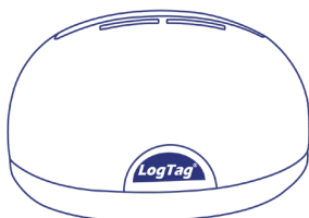
LTI-HID Interface Not Included - Optional