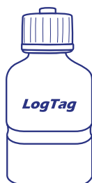
Glycol Buffer Not Included - Optional

Sensors are available with a 1.5m or 3m cable. E.g. ST100J-15 for 1.5m or ST100J-30 for 3m cable.