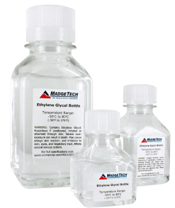
Ethylene glycol bottle (optional)