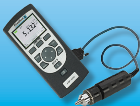
STS Sensor attached to the DFS II-R-ND gauge for torque measurement.