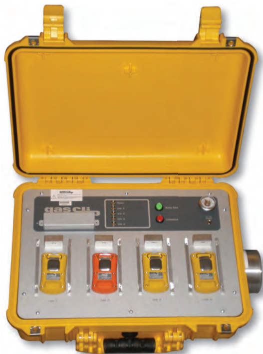
“Clip Dock” Docking Station