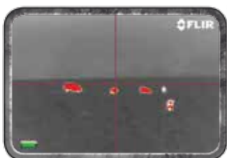
Hogs in InstAlert™

The R-Series offers up to six different detection palettes, including FLIR's exclusive InstAlert™, which displays the hottest temperatures in red so you can detect animals, people and other warm objects more easily.