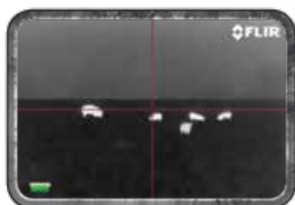
Hogs in White Hot