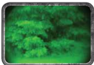
Conventional I 2 optics