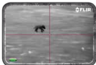
Fox in Black Hot