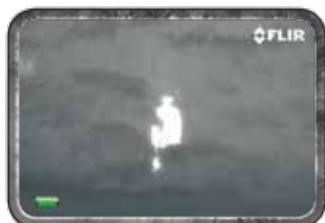
FLIR Thermal Heat signature