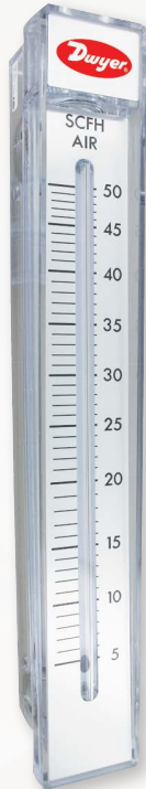
Model RMC 10" scale, 15-3/8" high