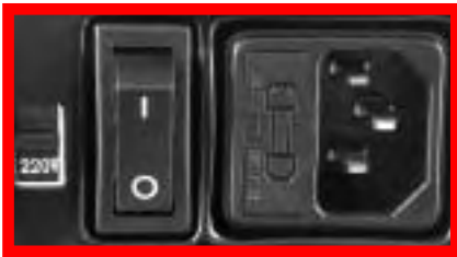
Universal IEC plug All units/dual voltage 115V & 230V