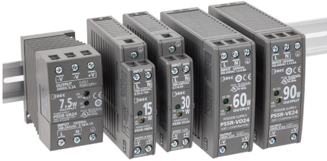
PS Series Capable of supplying up to 90 Watts (AV01 DIN rail not included)