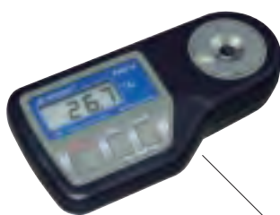
PR-101 \alpha Cat.No.3442