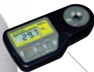
PR-32 \alpha Cat.No.3405

Four models of the Palette \alpha are available for your different measurement samples.