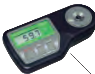
PR-201 \alpha Cat.No.3452