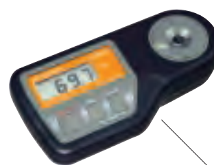
PR-301 \alpha Cat.No.3462