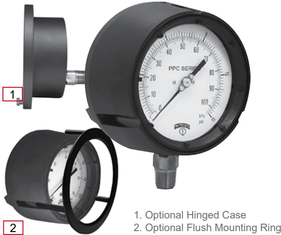
1. Optional Hinged Case 2. Optional Flush Mounting Ring