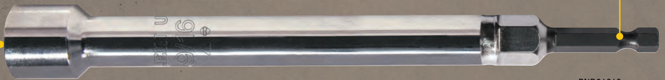
Available in 2", 5" and 10" lengths