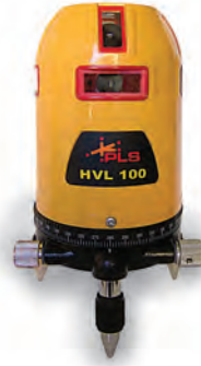
Class II Laser Product