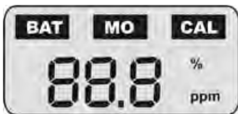
Figure 1: Custom Display

The TPI PGM100 is an exceptionally rugged personal gas monitor. The PGM100 is available in single gas configurations only. Preset alarms provide visual, audible and vibration alerts for low and high alarm conditions. Built-in "Time Weighted Average" (TWA) and "Short Term Exposure Limit" (STEL) alarms provide even greater margin of safety for the user. A custom display provides the user with easy to view information including gas concentration, time remaining in months to sensor replacement, battery low alert and activation of calibration process. (See Figure 1)