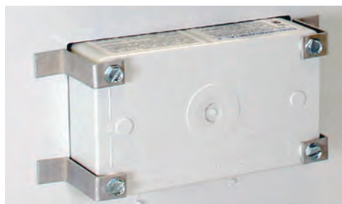
Figure 1. Rear View of Panel Mounting Kit