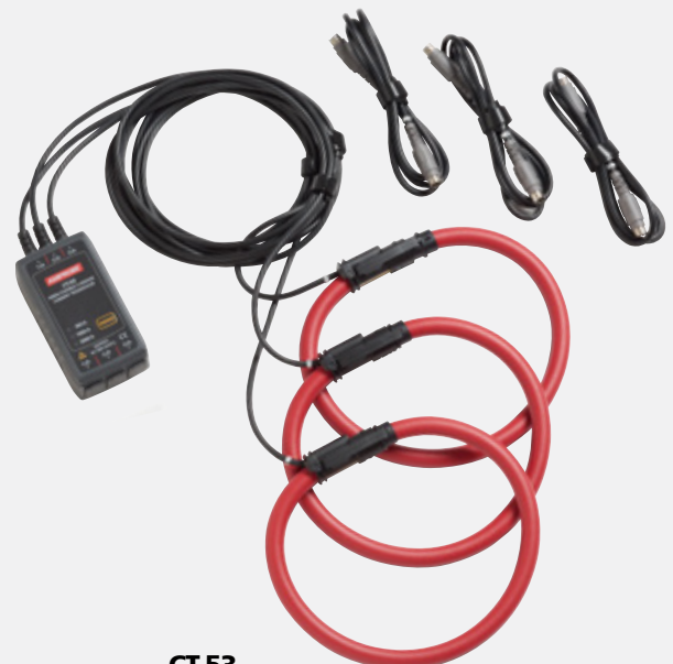
CT-53 Flex Current Sensor

← . . . . High performance processor for accurate, detailed data recordings