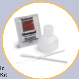
Fiber Optic Cleaning Kit