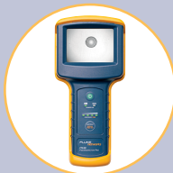
FiberInspector Pro™ Video Microscope