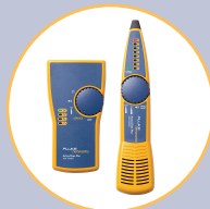
IntelliTone™ Pro Toner and Probe