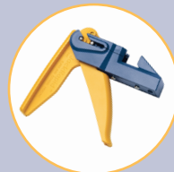
JackRapid™ Punchdown Tool