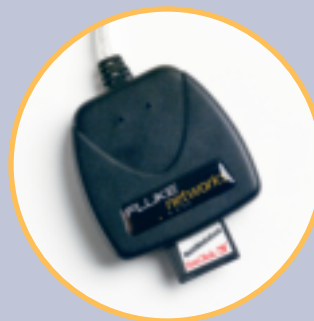
MultiMedia Card Reader