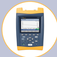
OptiFiber® Certifying OTDR

The essential cable verification tester for verifying and troubleshooting cabling media.