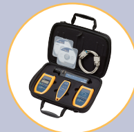
SimpliFiber™ Loss Test Kits

Check our complete line of SuperVision products like these at www.flukenetworks.com