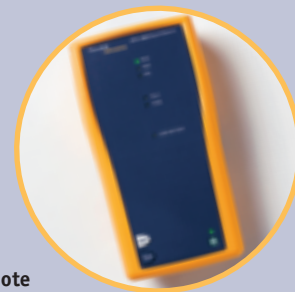
DTX-1800 Smart Remote