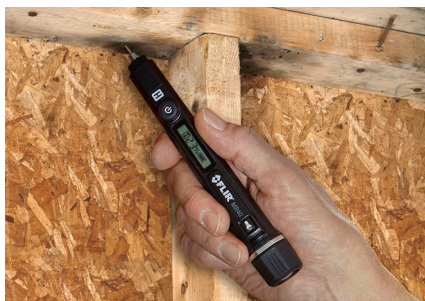
Rugged, compact design for measurements in tight spaces