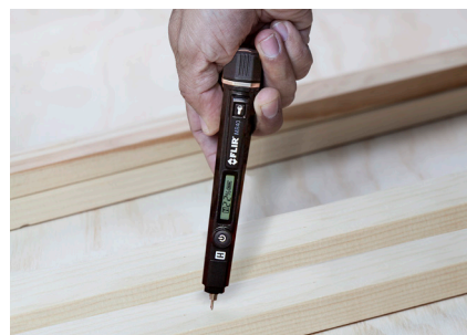
Quick and easy to use; reliable and accurate results