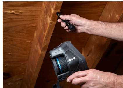
Use MR40 to confirm whether the cold spot found in a thermal image is moisture