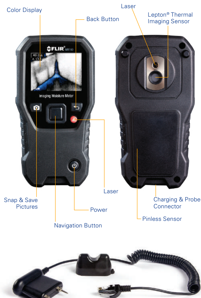
MR02 Pin Probe included