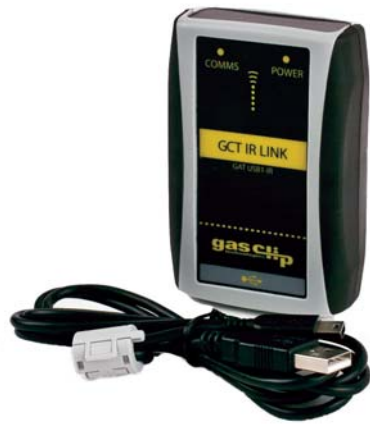
GCT IR Link

10' Sampling Hose 10 Additional Filters; 5 Hydrophobic and 5 Particulate Stainless Steel Diffusion Stone