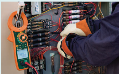
Test leads included for Multimeter functions