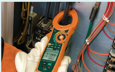
2.0" (52mm) jaw size for conductors up to 500MCM