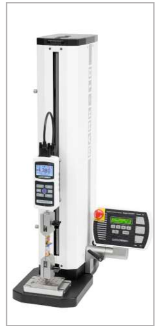
Shown with an ESM303 test stand and G1008 film & paper grips

Series 4 gauges include MESUR® Lite data acquisition software. MESUR® Lite tabulates continuous or single point data from Series 5 and 4 gauges. Data saved in the gauge's memory can also be downloaded in bulk. One-click export to Excel button easily allows for further data manipulation.