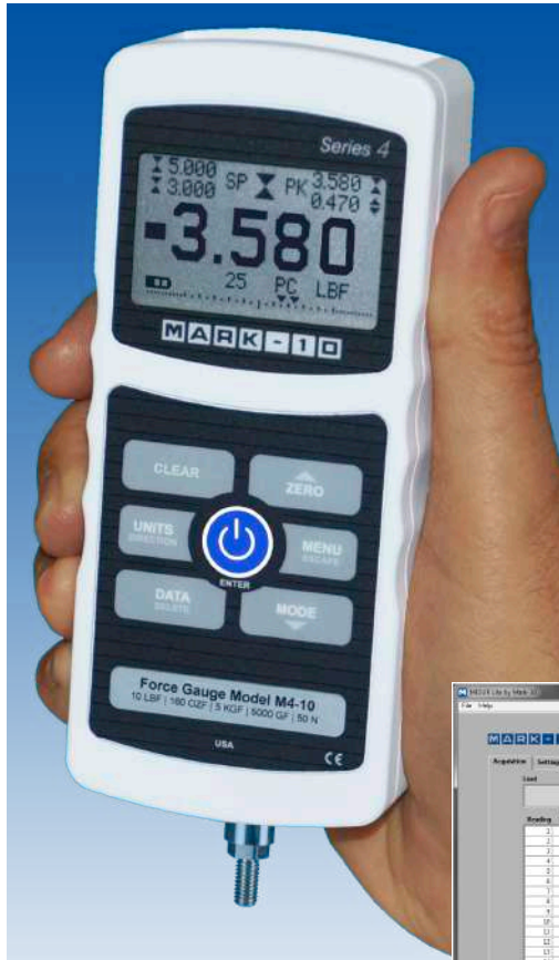
MESUR® Lite data acquisition software is included with Series 4 gauges