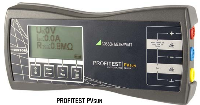
PROFITEST PV SUN