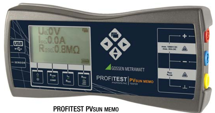
PROFITEST PV SUN MEMO