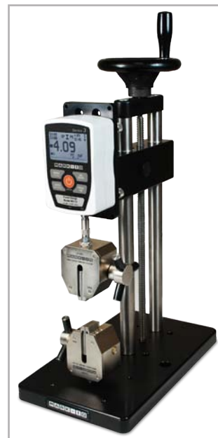
Shown with an ES20 test stand and G1061 wedge grips

Series 3 gauges include MESUR™ Lite data acquisition software, for tabulation of continuous or individual data points. One-click export to Excel button easily allows for further data manipulation.