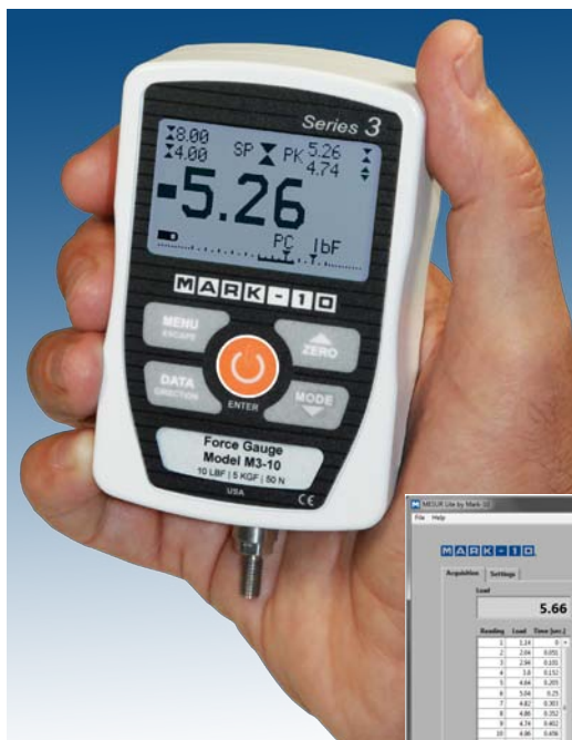
MESUR Lite data acquisition software is included with Series 3 gauges