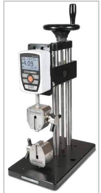
Shown with an ES20 test stand and G1061 wedge grips

Series 3 gauges include MESUR® Lite data acquisition software, for tabulation of continuous or individual data points. One-click export to Excel button easily allows for further data manipulation.