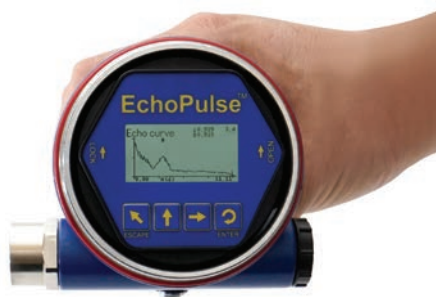
Echo Signal Return Curve Shown