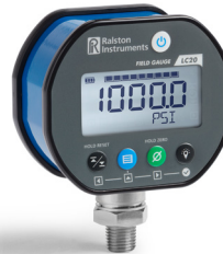
Field Gauge LC20