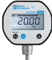
Field Gauge LC10-TA Digital Probe Thermometer