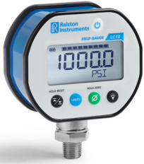
Field Gauge LC10

Check Out Our Full Line of Compact, Durable Precision Pressure, Vacuum and Temperature Gauges