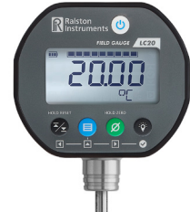
Field Gauge LC20-TA Digital Probe Thermometer

Ralston Instruments provides complete pressure calibration solutions for a wide range of applications, saving time and taking the guesswork out of critical pressure testing, maintenance and repair operations.