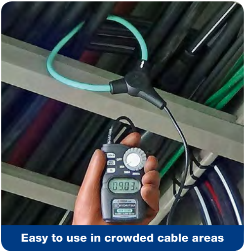
Easy to use in crowded cable areas