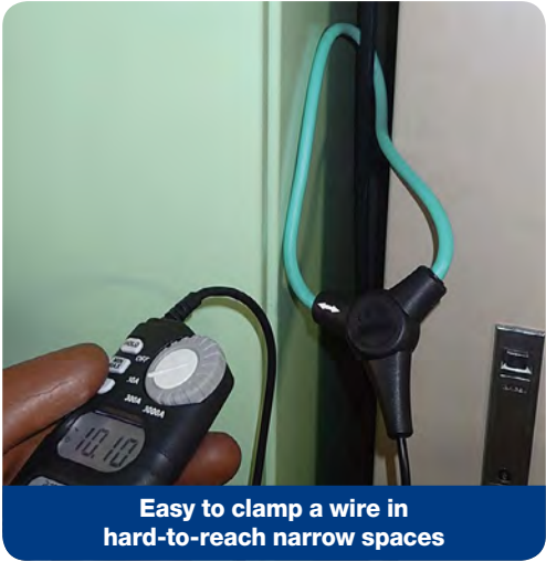
Easy to clamp a wire in hard-to-reach narrow spaces