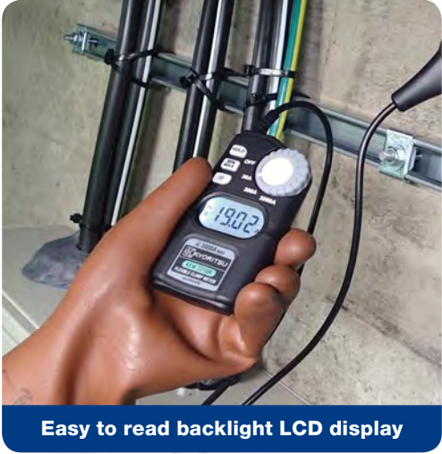
Easy to read backlight LCD display