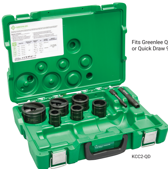
Fits Greenlee Quick Draw® or Quick Draw 90° Driver