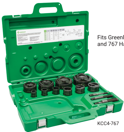
Fits Greenlee 746A Ram and 767 Hand Pump