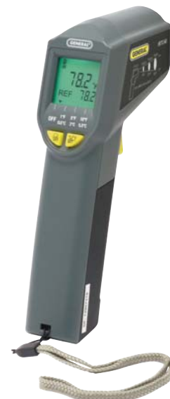
IRTC40 8:1 Scanning IRT with Tricolor LCD (see page 6)