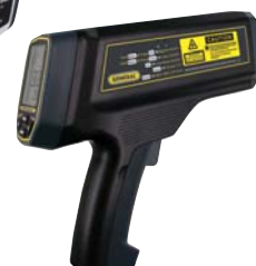
IRT5000 (see page 9)