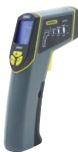
IRT657 (see page 10)