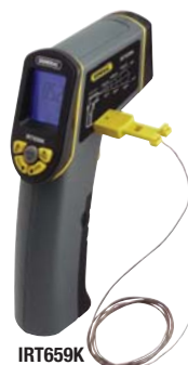
IRT659K (see page 8)