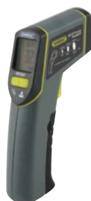
IRT207 (see page 11)