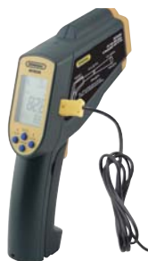
IRT850K (see page 7)