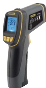
IRT730K (see page 8)