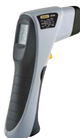
IRT650 (see page 10)