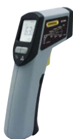
IRT206 (see page 11)

U.S. General Services Administration (GSA) Schedule Contracts are long-term, government-wide contracts between commercial firms and the GSA designed to give federal consumers (e.g., federal agencies and the military) access to commercial products and services at fair, reasonable and competitive prices. Such contracts comply with the Trade Agreements Act (TAA) of 1979, which requires that purchased products and services were manufactured or “substantially transformed” in a “designated country”. Taiwan is a TAA-designated country; China is not.