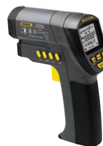
IRT855DL (see page 9)