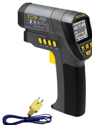
IRT855DL 50:1 Ultra Wide-Range Data Logging IRT with "K" Port (see page 9)