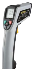
IRT670 (see page 10)