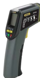
IRTC50 (see page 6)