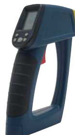
IRT500DL (see page 9)