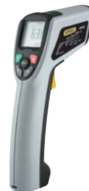
IRT675 (see page 10)