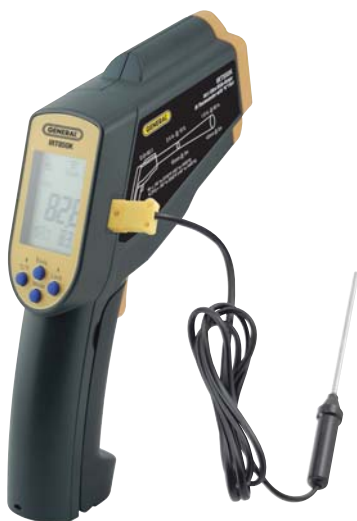
IRT850K 50:1 Ultra Wide-Range IRT with "K" Port (see page 7)