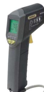
IRTC40 (see page 6)