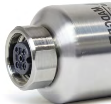
Closeup of the M12 Connector