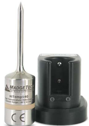
IFC400 (sold separately)

Using the MadgeTech Software, starting, stopping and downloading the HiTemp140 is simple and easy. To use, simply place the HiTemp140 in the IFC400 or IFC406 docking station (sold separately). Using the software, an immediate or delay start can be chosen, as well as the reading rate. Start the data logger, remove it from the docking station and the device is ready to be deployed. Graphical, tabular and summary data is provided for analysis and data can be viewed in °C, °F, K or °R. The data can also be automatically exported to Excel® for further calculations.