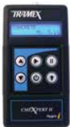
Product code: CMEX2

The Hygro-i ® probe is used with the CMEX II or the MRH III for relative humidity testing of flooring slabs and ambient conditions.