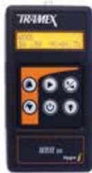
Product code: MRHIII