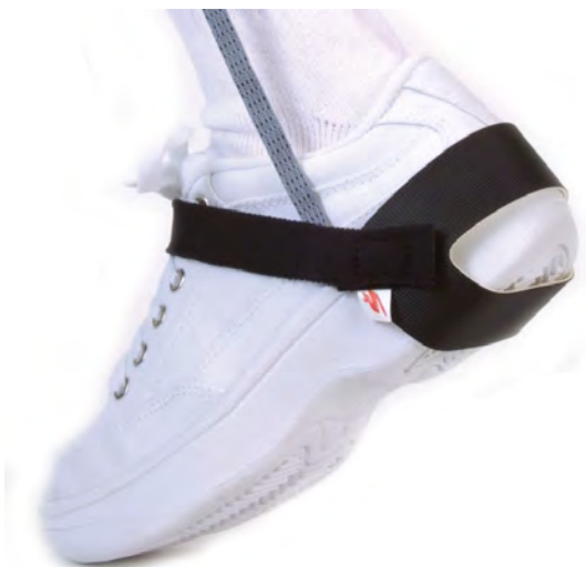
Elastic Hook and Loop Strap for Comfort and Visibility