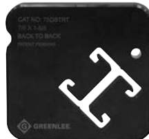
78DSTR Back-to-Back Strut 7/8"