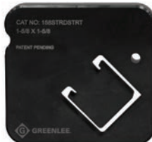
158STRDSTR Strut 1-5/8" x 1-5/8"