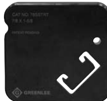
78SSTR Strut 7/8" x 1-5/8"