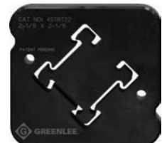
4STRT22 Cooper B-Line® Strut 4D22 2-1/8" x 2-1/8"