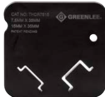
THDR7515 Top-Hat DIN Rail Combo Die 7.5mm & 15mm x 35mm