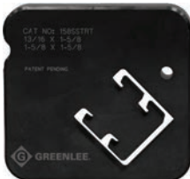
158SSTR Dual-Profile Strut 1-5/8" x 1-5/8" & 1-5/8" x 13/16"