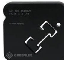
4STRT21 Cooper B-Line® Strut 4D21 2-1/8" x 1-1/16"