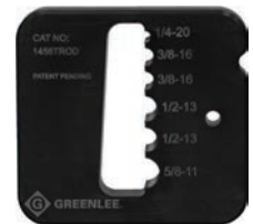
1458TROD Threaded Rod 1/4", 3/8", 1/2", 5/8"