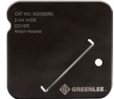
3000SSRC Legrand 3000 Series Raceway 2-3/4" (Cover)