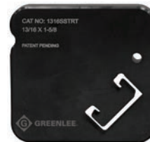
1316SSTR Strut 13/16" x 1-5/8"