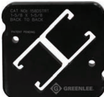
158DSTR Back to Back Strut 1-5/8" x 3-1/4"