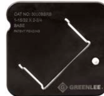
3000SSRB Legrand 3000 Series Raceway 1-15/32" x 2-3/4" (Base)