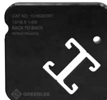
1316DSTR Back-to-Back Strut 13/16"