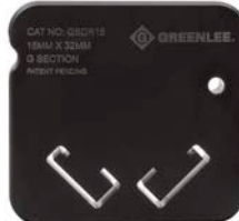
GSDR15 G-Section DIN Rail