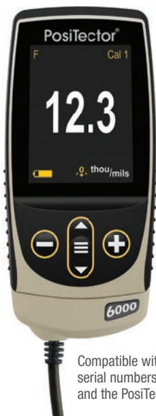
PosiTector 6000 FNGS1

Compatible with PosiTector bodies with serial numbers greater than 700,000 and the PosiTector SmartLink.