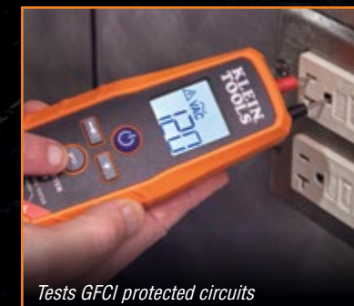
Tests GFCI protected circuits