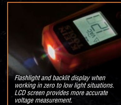
Flashlight and backlit display when working in zero to low light situations. LCD screen provides more accurate voltage measurement.