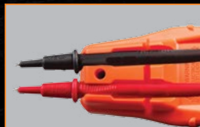
Test-leads seated in the lead holders on the back of the tester are spaced correctly to test tamper-resistant US-style outlets.