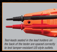
Test-leads seated in the lead holders on the back of the tester are spaced correctly to test tamper-resistant US-style outlets.