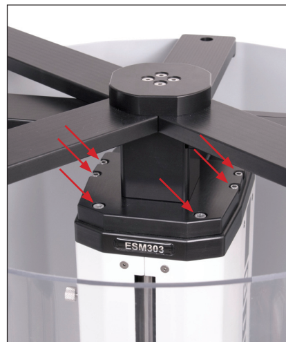
Fig. 1 Attaching the shield assembly to the ESM303 test stand column

With prior firmware versions, the FollowMe™ function will not operate while the door is open, however, the Auto Return function can still be used to return the crosshead to the home position automatically. Contact Mark-10 for upgrade instructions. For further instructions refer to the ESM303 user's guide.