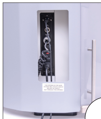
Fig. 3 Proper cable routing