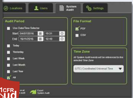
Detailed system audit reporting

A Cloud account subscription is created during the WiFi sensor set-up process using EasyLog 21CFR WiFi Sensor Software. 21CFR WiFi Sensors are only compatible with the 21CFR Cloud.