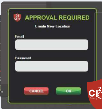
Authority sign-off on actions