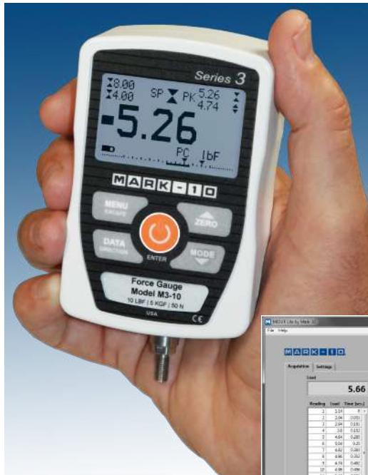
MESUR® Lite data acquisition software is included with Series 3 gauges