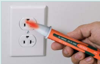
Quickly check for the presence of live wires before testing