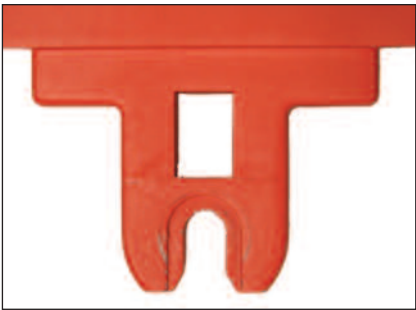
Hot Stick Connection: Shotgun or Universal Spline

The high voltage resistors limit the current through the ground cord to a maximum of less than one milliamp. Although the ground cords are insulated for voltage up to 20kV, they should always be kept free and clear from you and any other conductors.